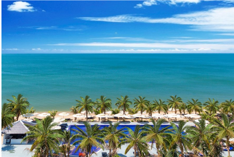
Beach and Hotel Pool on Phu Quoc

Extend your stay on the beach: Why not extend your trip to Vietnam with three nights on the tropical white sand beaches of Phu Quoc Island? Nestled in the warm waters of the Gulf of Thailand this Vietnamese island is 90% national park, a thick-rainforest interior framed by idyllic white sand beaches. Easily accessible by a short flight from Hanoi, Siem Reap or Ho Chi Minh City, this is a great way to unwind after an action-packed trip in Indochina. Click here for more details.